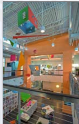
Walker Brands 2009 Horizon Award Project of the Year Winner

· Florida had 60,000 construction firms in 2006, of which 90.5% were small businesses employing fewer than 20 workers.